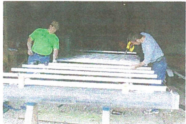
Construction of the new Dock walkway All materials were donated by Helmcamp Construction Company.

Indoor practices are well underway, please come join us and get yourself in shape for the season. First day on the water can't be more than a month away so if you're interested in learning more, someone will help you. This is also an excellent opportunity to meet others and see what show skiing is all about.